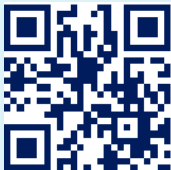
Enrolment / Enquiry Form

To enrol, please fill out the Enrolment Form which Can be obtained using the QR code below.